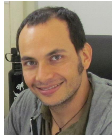
Rodrigo Villate / GIZ Costa Rica Principles of NDC Accounting