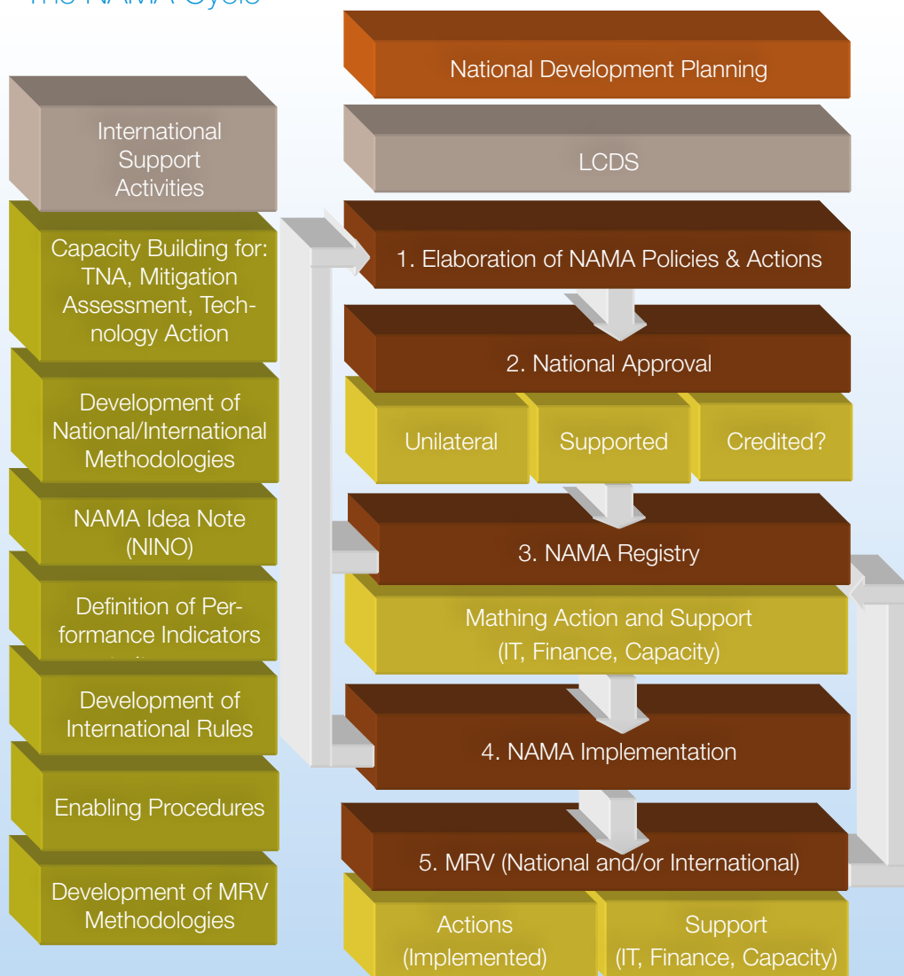
Figure 2 – The NAMA Cycle

The design and national prioritization of NAMAs will be influenced by the emerging international architecture for providing financial and technical support and registering achievements. Though the procedures have not been completed, the Cancun decisions indicate possible elements of a NAMA Cycle at the international level. Complementary national level processes will have to be developed by countries to develop and propose NAMAs to the Convention.