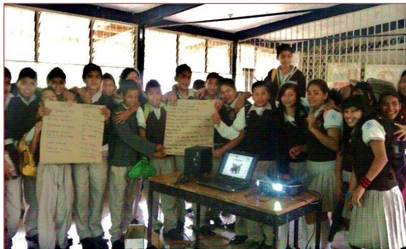
Students setting mitigation action priorities