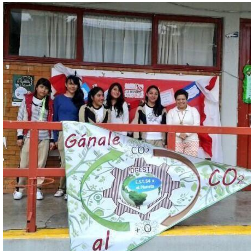
Children as climate change ambassadors

This programme is carried out through actions led by the educational community. These activities are registered on a platform that serves as an interactive portal for environmental education.