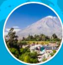
Latin America & Caribbean