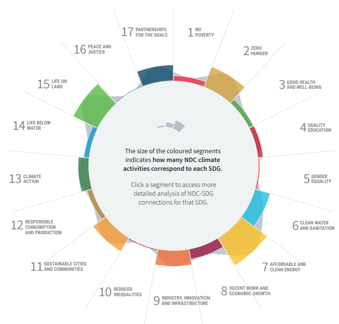
Figure 1: NDC activities in the 17 SDGs

The 2030 Agenda encompasses 17 SDGs, 169 targets and a declaration text articulating the principles of integration, universality, transformation and a global partnership. The SDGs integrate the social, environmental and economic