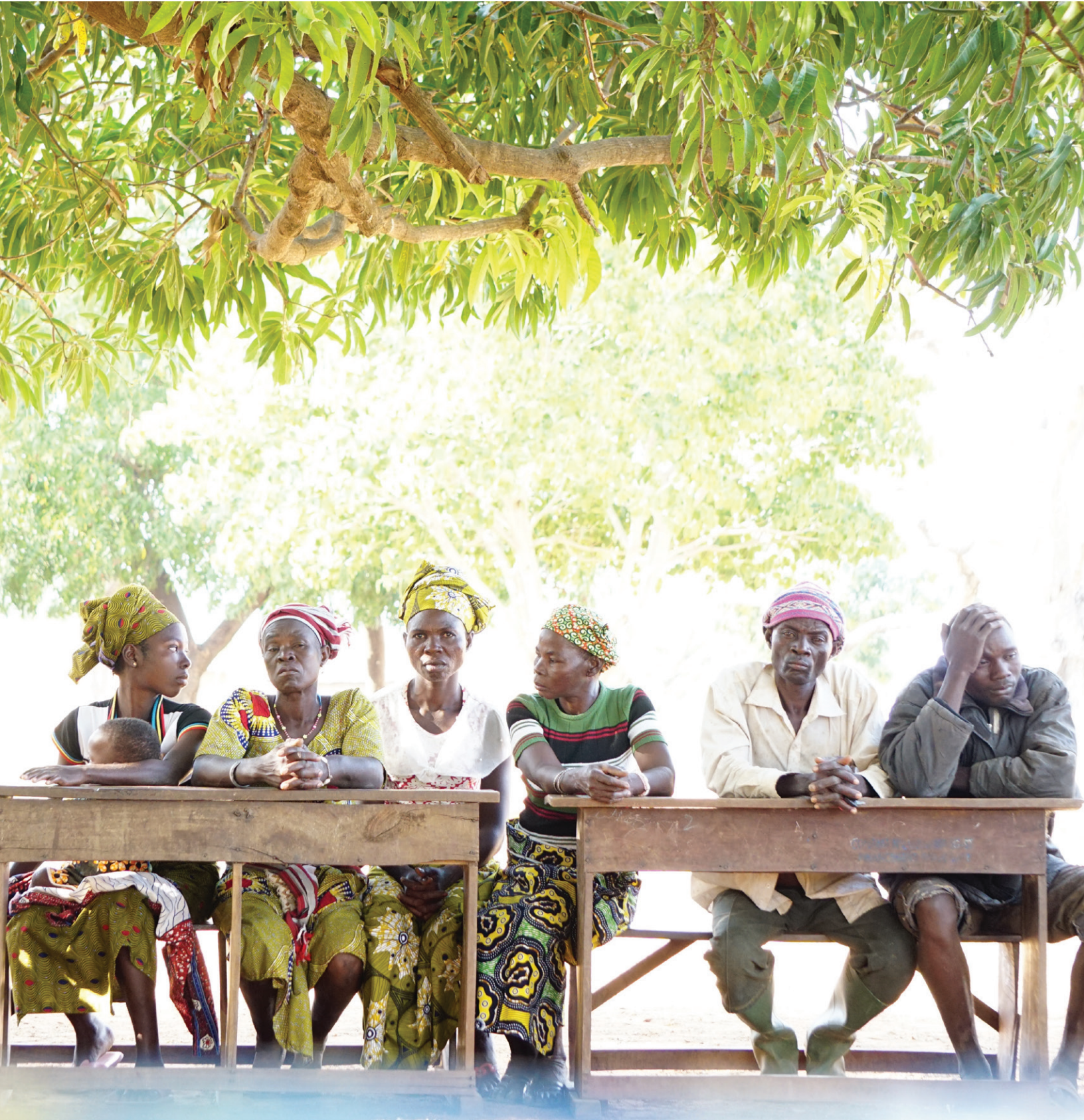
Stakeholder engagement meeting in Ghana.