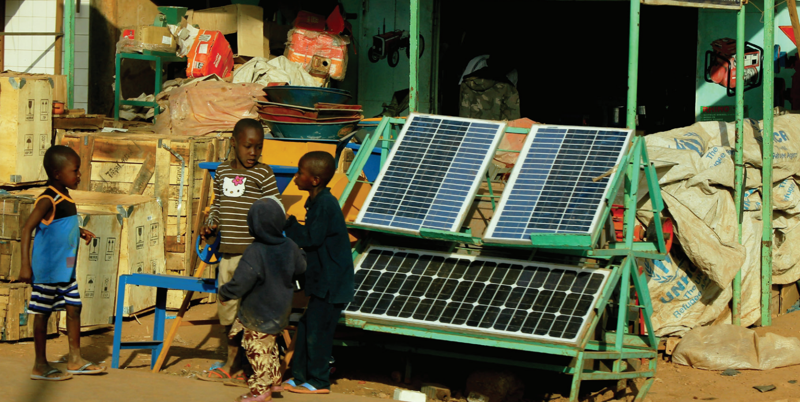
Solar panels in Ouagadougou, Burkina Faso. A picture chosen from AF Photo contest focused on the theme of "urban adaptation and resilience".