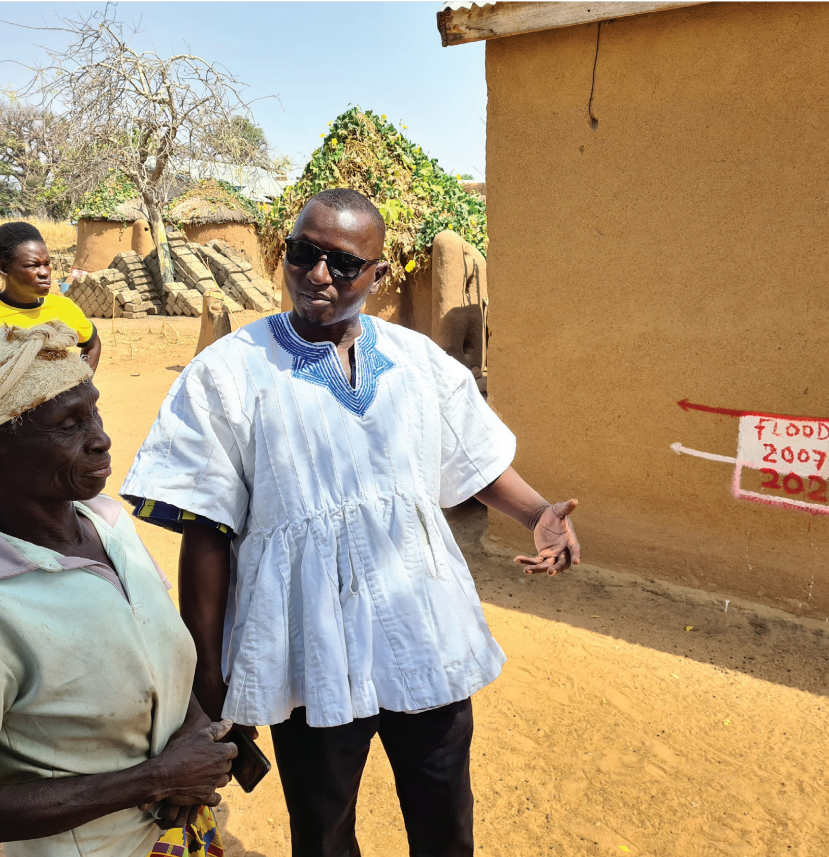
Flood water level markings are an important element of warning residents when they must evacuate their homes in Ghana.