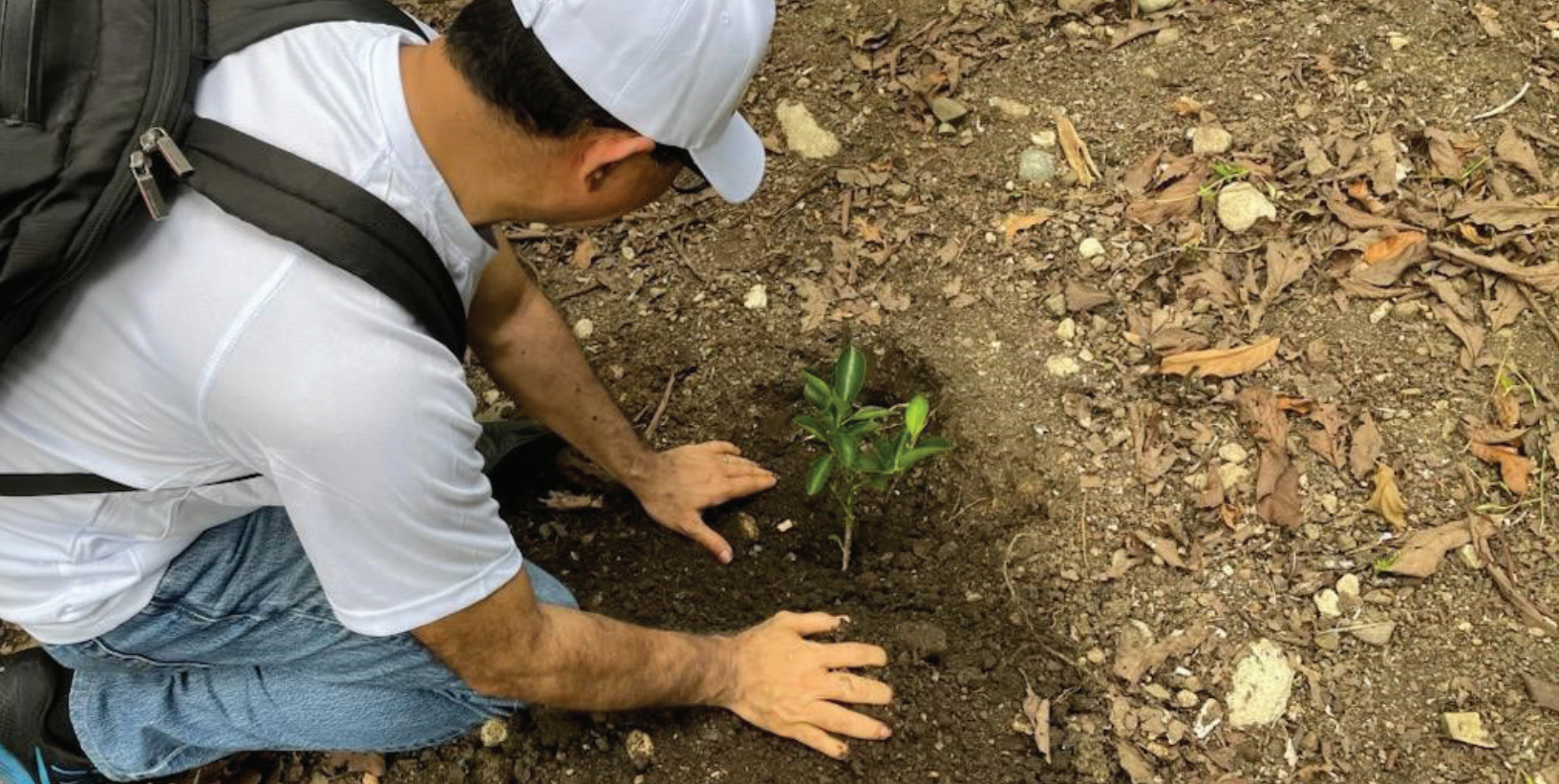
Communities adapting to drought and floods through improving water security and sustainable forest agricultural approaches in Dominican Republic.