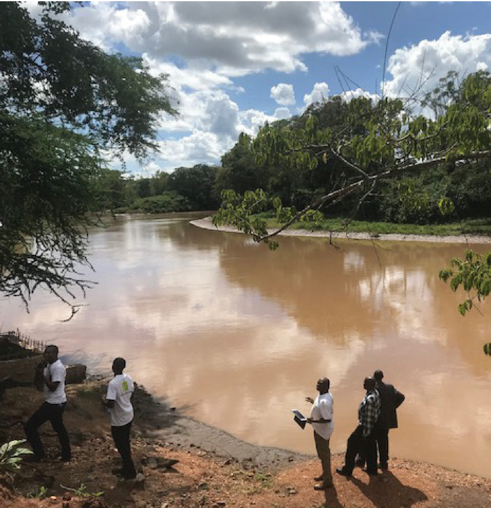
A village in Ghana uses river level markings to indicate when local communities should seek shelter.