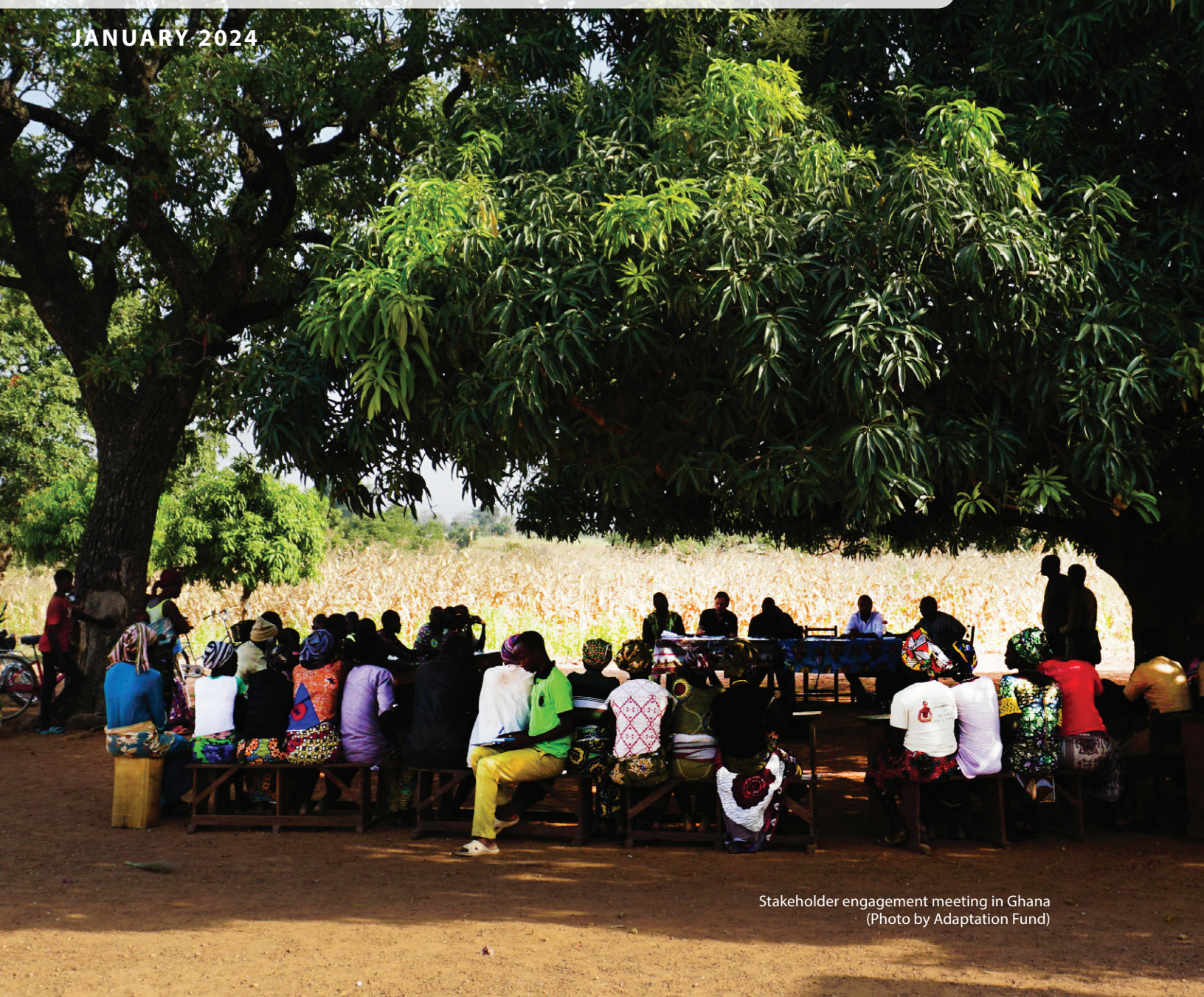
Stakeholder engagement meeting in Ghana