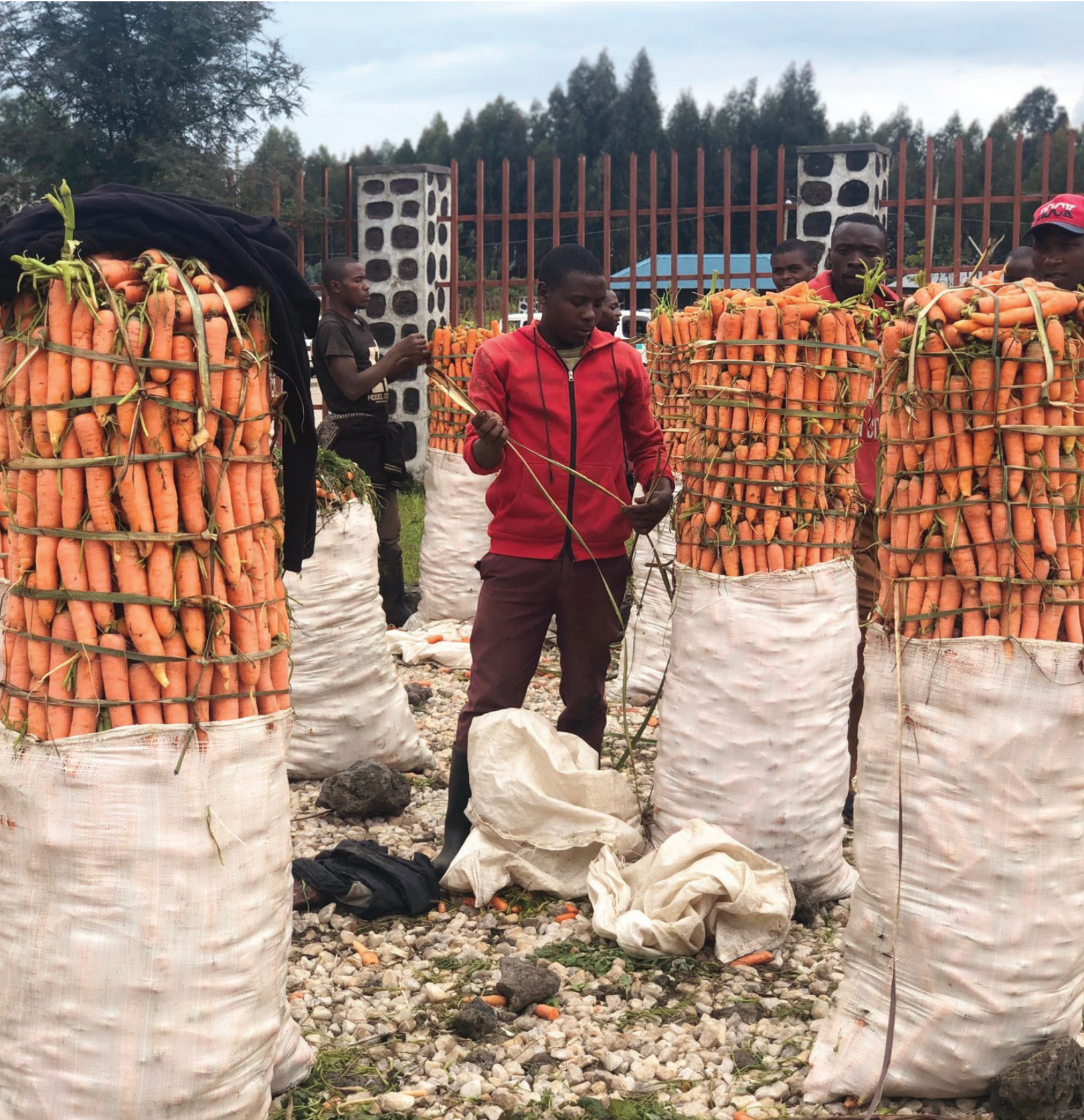
AF-funded community-based adaptation project aimed at adapting to extreme rainfall and flooding, and creating alternative livelihoods and training among young persons in Rwanda.