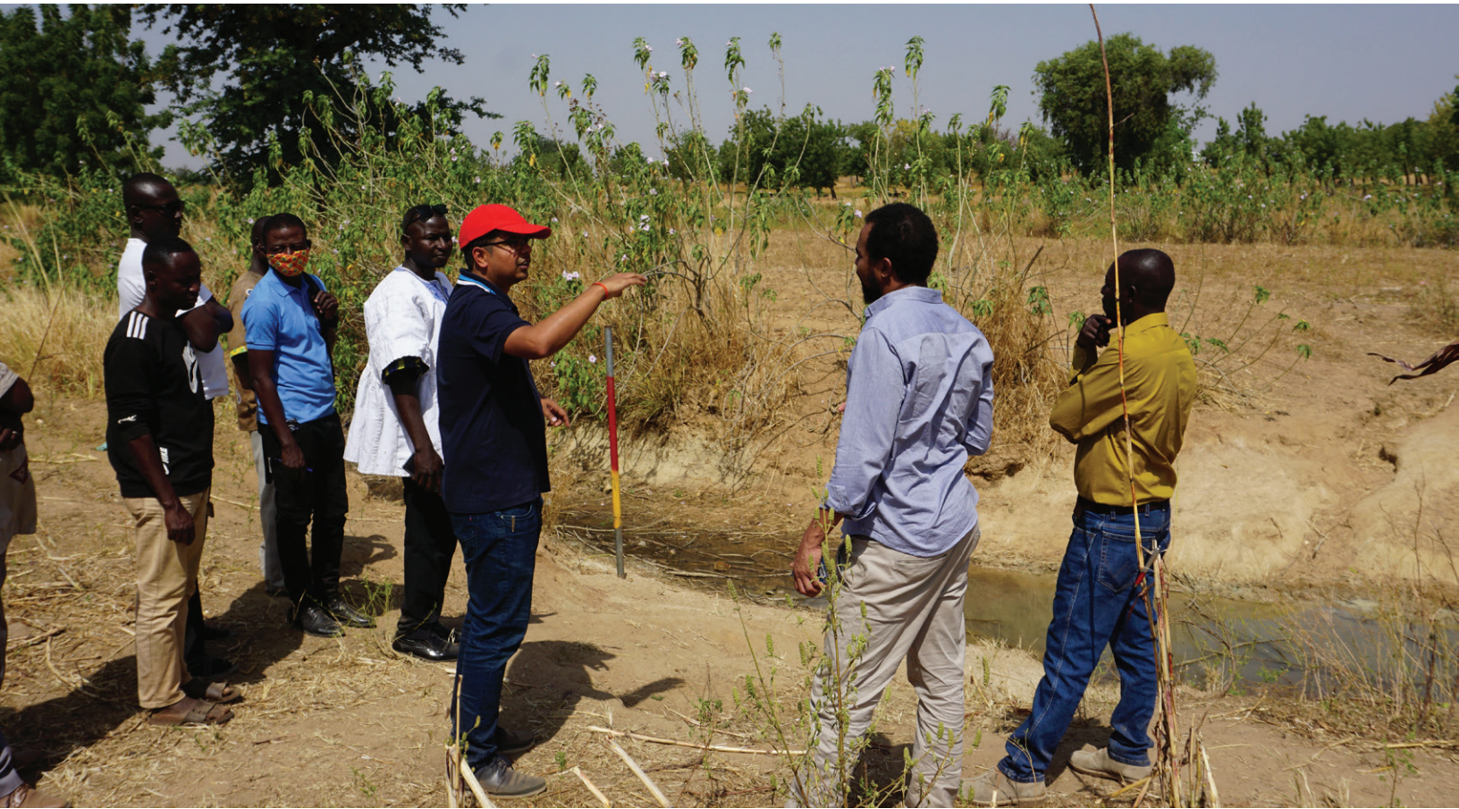
AF staff visit to drought-affected area in Ghana project where an integrated flood and drought management system is being developed.

adaptable to changing circumstances on the ground.