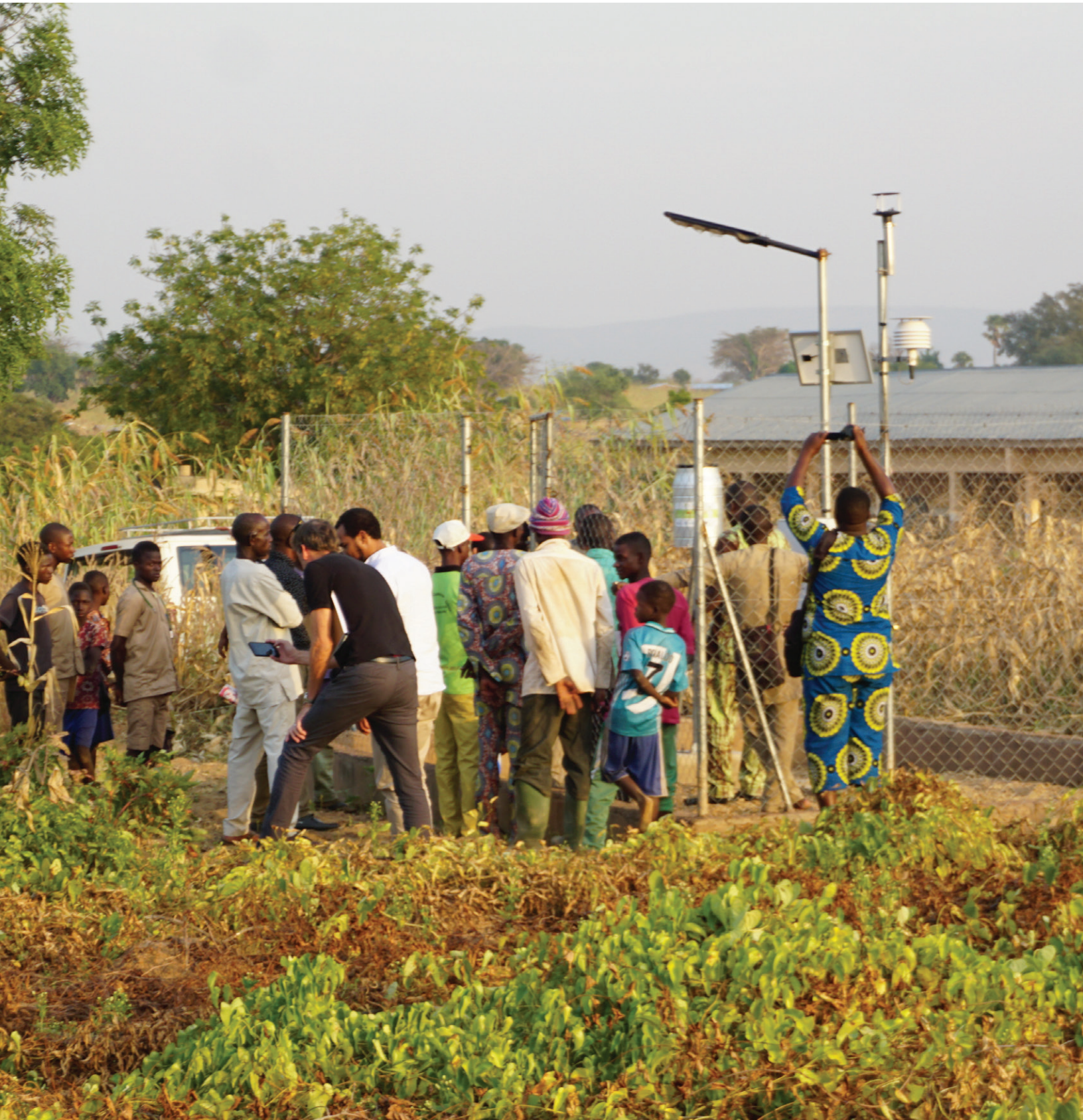
Community members learn how weather stations gather data in Benin