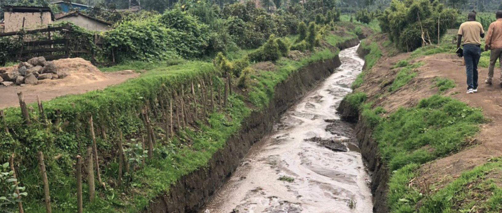
AF project in Rwanda is using agricultural terracing and improved drainage to help vulnerable communities adapt to flooding.

the specific circumstances of each region and promoting coordination, flexibility, and conflict sensitivity can advance climate resilience in conflict-affected and fragile settings.