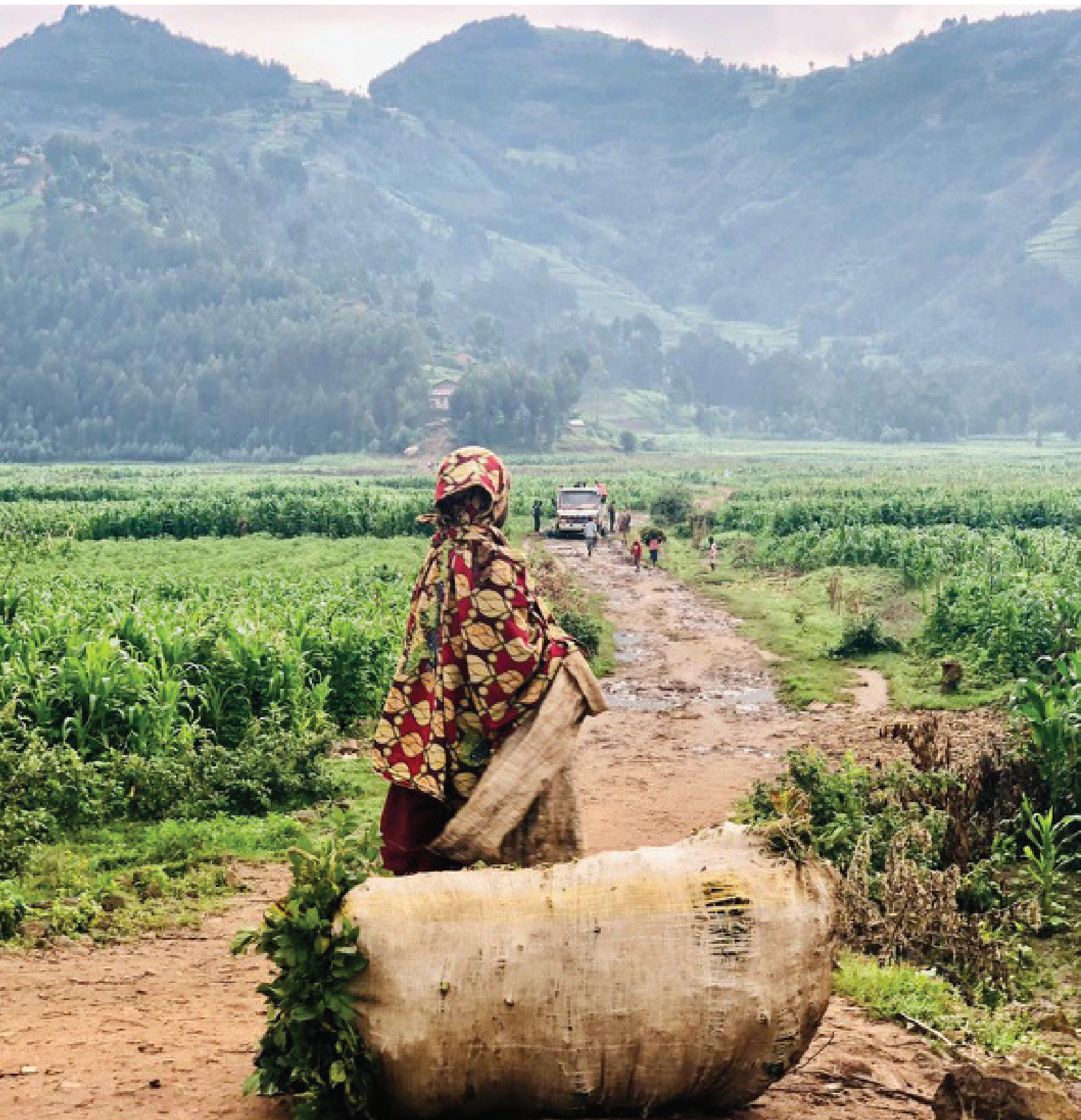
Increasing the adaptive capacity of natural systems and rural communities to climate change impacts in Rwanda.