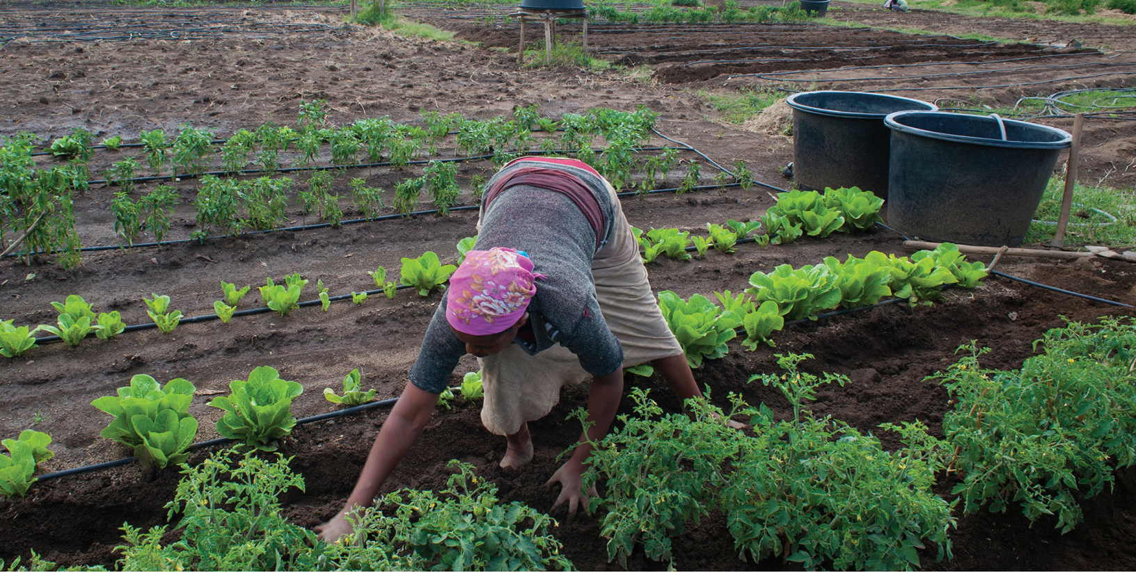
The use of elevated water storage tanks allows the efficient use of drip irrigation to combat drought in AF-funded project in Ethiopia.