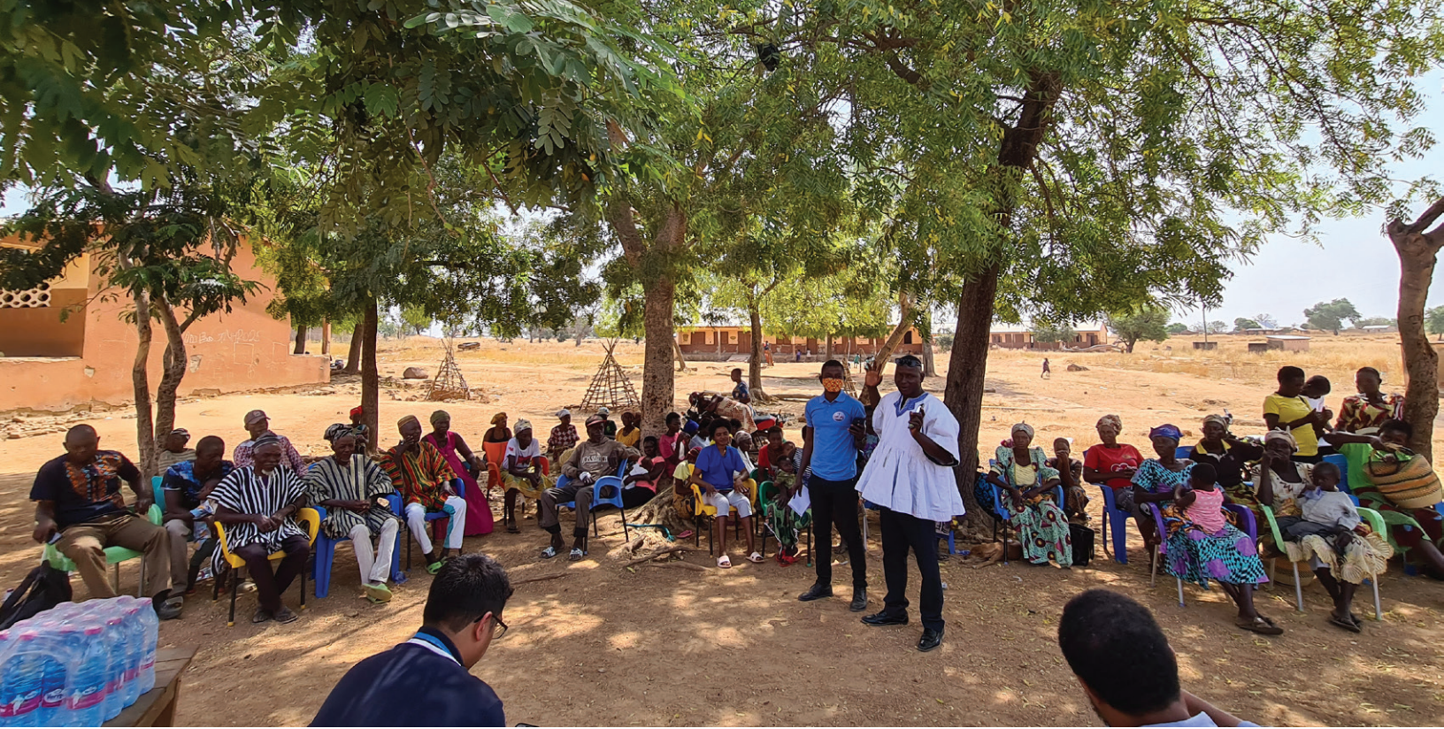
Engaging with project committee and community leaders in Benin.